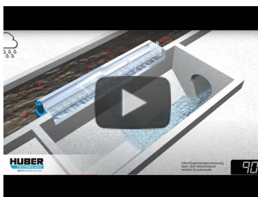
Animation: HUBER Storm Screen ROTAMAT® RoK2 for stormwater discharges with integrated weir

https://www.youtube.com/watch?v=eX4CKg7I3zw