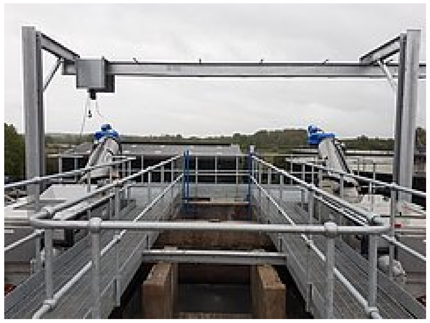
2x HUBER Sludge Acceptance Plant ROTAMAT® Ro3/1200/355 units installed at Wanlip STW

HUBER Technology recently completed a project for Severn Trent Water at Wanlip STW on the outskirts of Leicester. This was a project that had been looked at for a long period of time but was commissioned in early 2020.