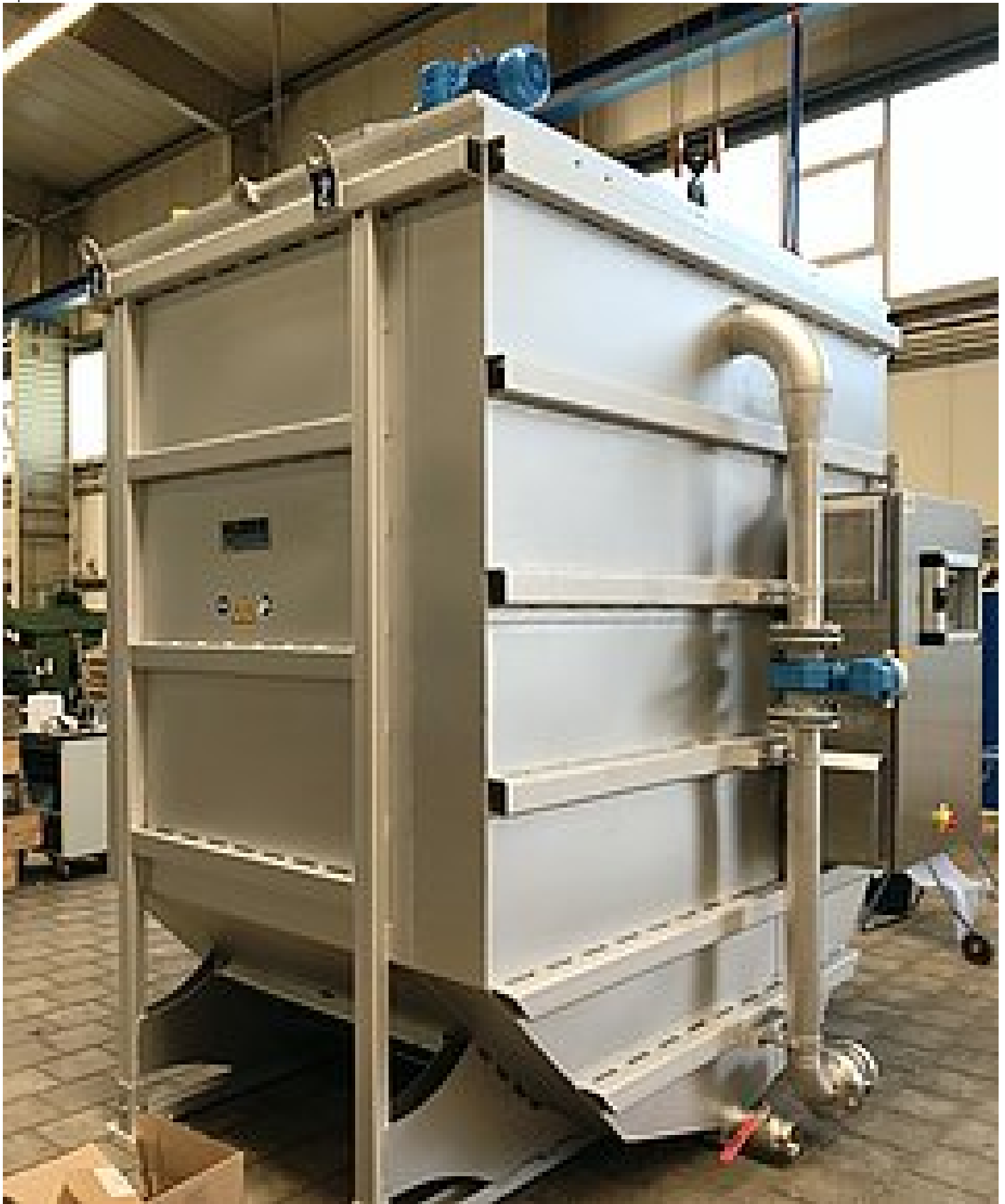
Ready for IFAT: The "big brother" of this HUBER Pile Cloth Media Filter RotaFilt® mobile demonstration plant will be exhibited at the world's leading trade fair of the industry.