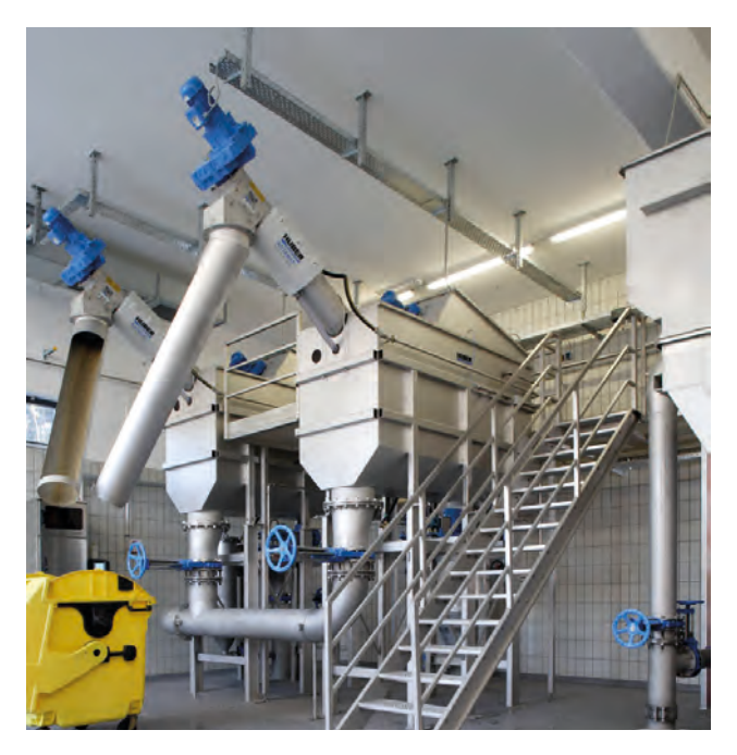
HUBER Rotary Drum Fine Screen ROTAMAT<sup>®</sup> Ro2 with high-pressure cleaning – best cleaning results and adapted machine technology.