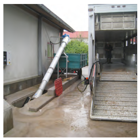
ally adapted mechanical pre-treatment –