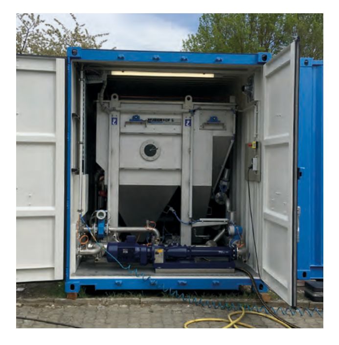
HUBER plant technology in container design – flotation or sludge dewatering units without construction work – ready for immediate use.