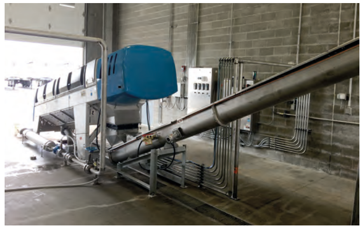
HUBER Screw Press units for sludge treatment – best dewatering performance and highest volume reduction for lower disposal costs.