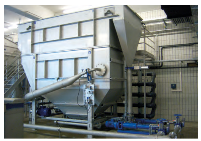
HUBER Dissolved Air Flotation for physical-chemical pre-treatment – optimum reduction of COD, fats and solids, more than 500 installations worldwide.