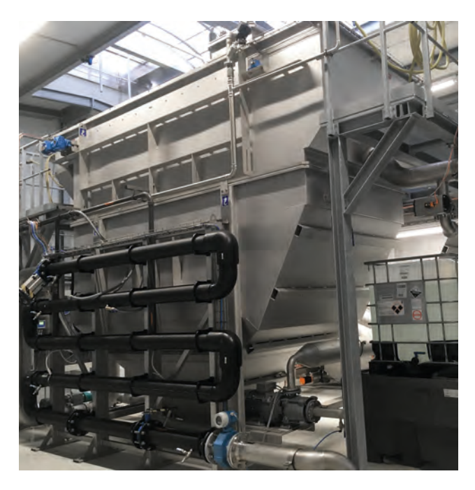
HUBER Dissolved Air Flotation Plants with chemical pre-treatment – full, partial or secondary treatment of industrial wastewater