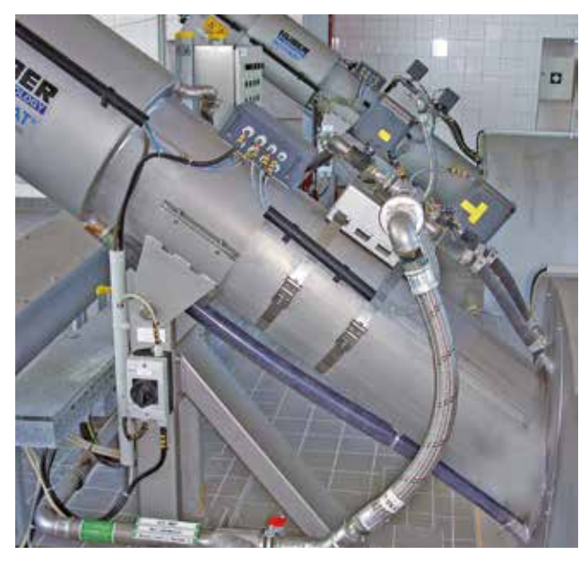
HUBER Fine Screen ROTAMAT® Ro1 with integrated Screenings Washing System IRGA installed in the channel.