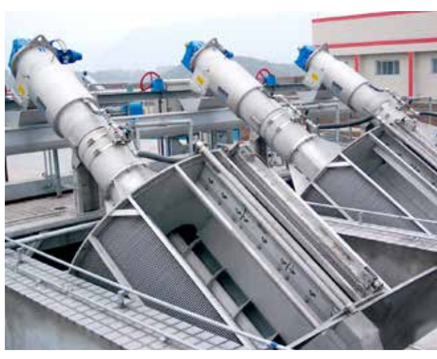
Several parallel HUBER Fine Screen ROTAMAT® Ro1 units installed in the channel.