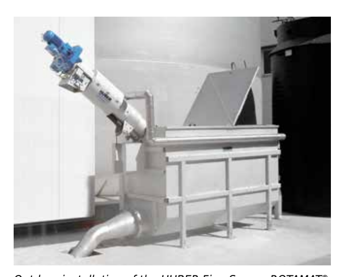
Outdoor installation of the HUBER Fine Screen ROTAMAT® Ro1 in tank.