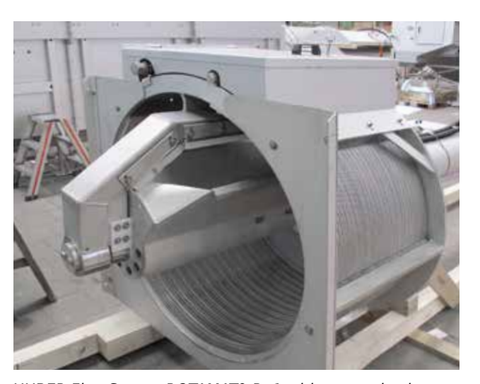
HUBER Fine Screen ROTAMAT® Ro1 with screen basket cover to prevent that splash water escapes.