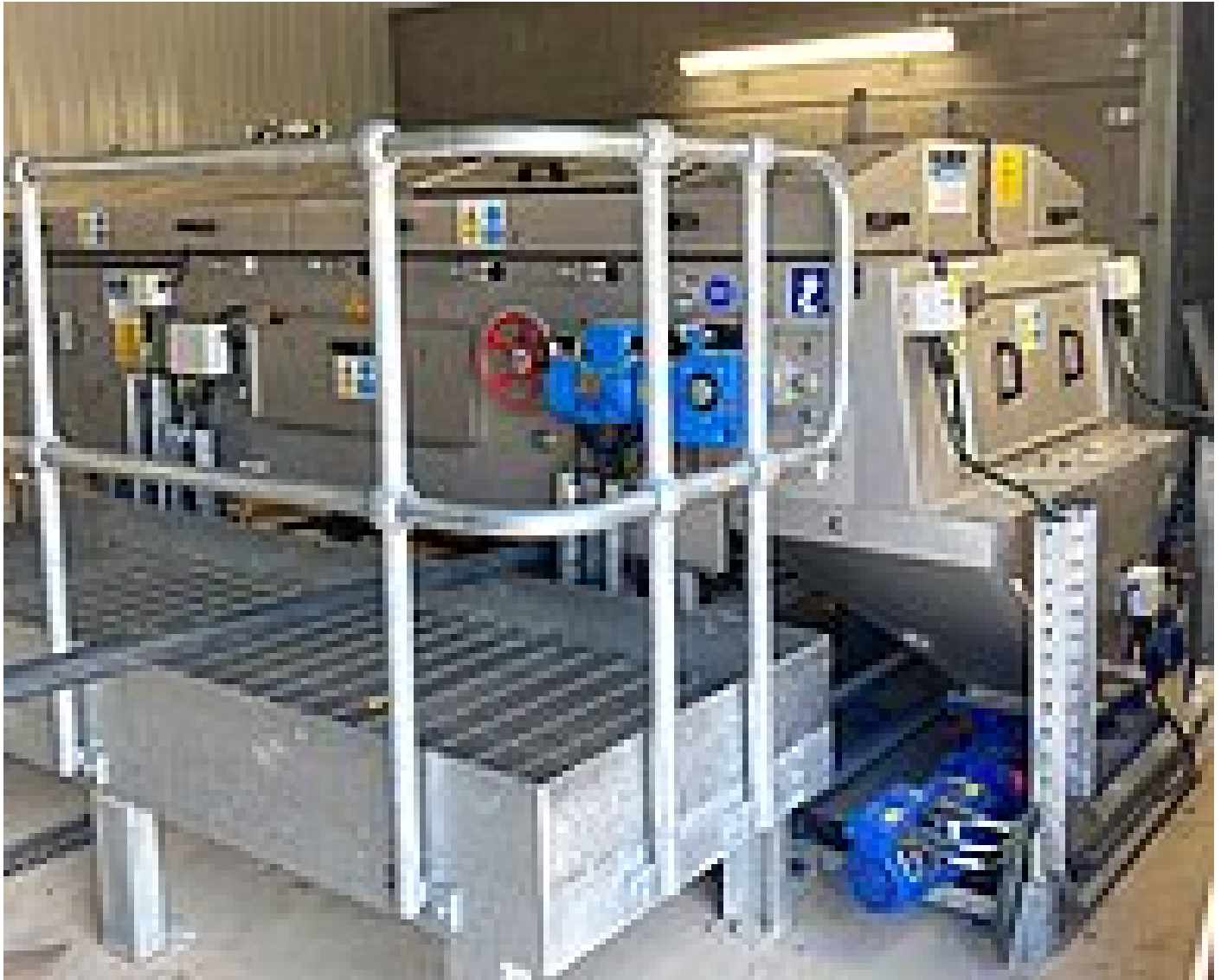
HUBER Belt Thickener DrainBelt - Sludge Thickener

A HUBER Technology Wastewater Case Study at Uttoxeter STW for Severn Trent Water