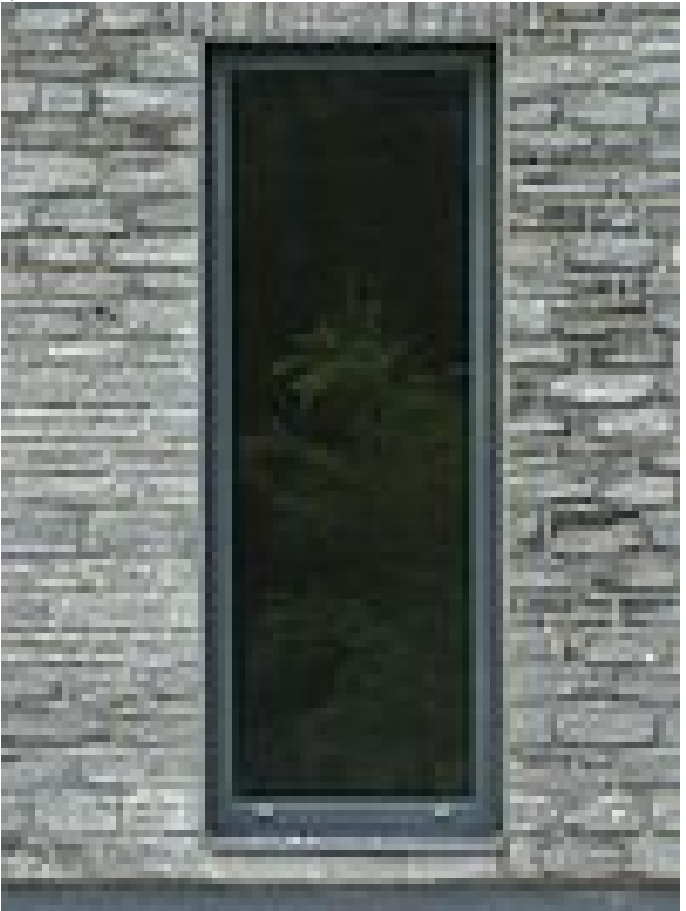
Window with thermo glass and hinged frame F2