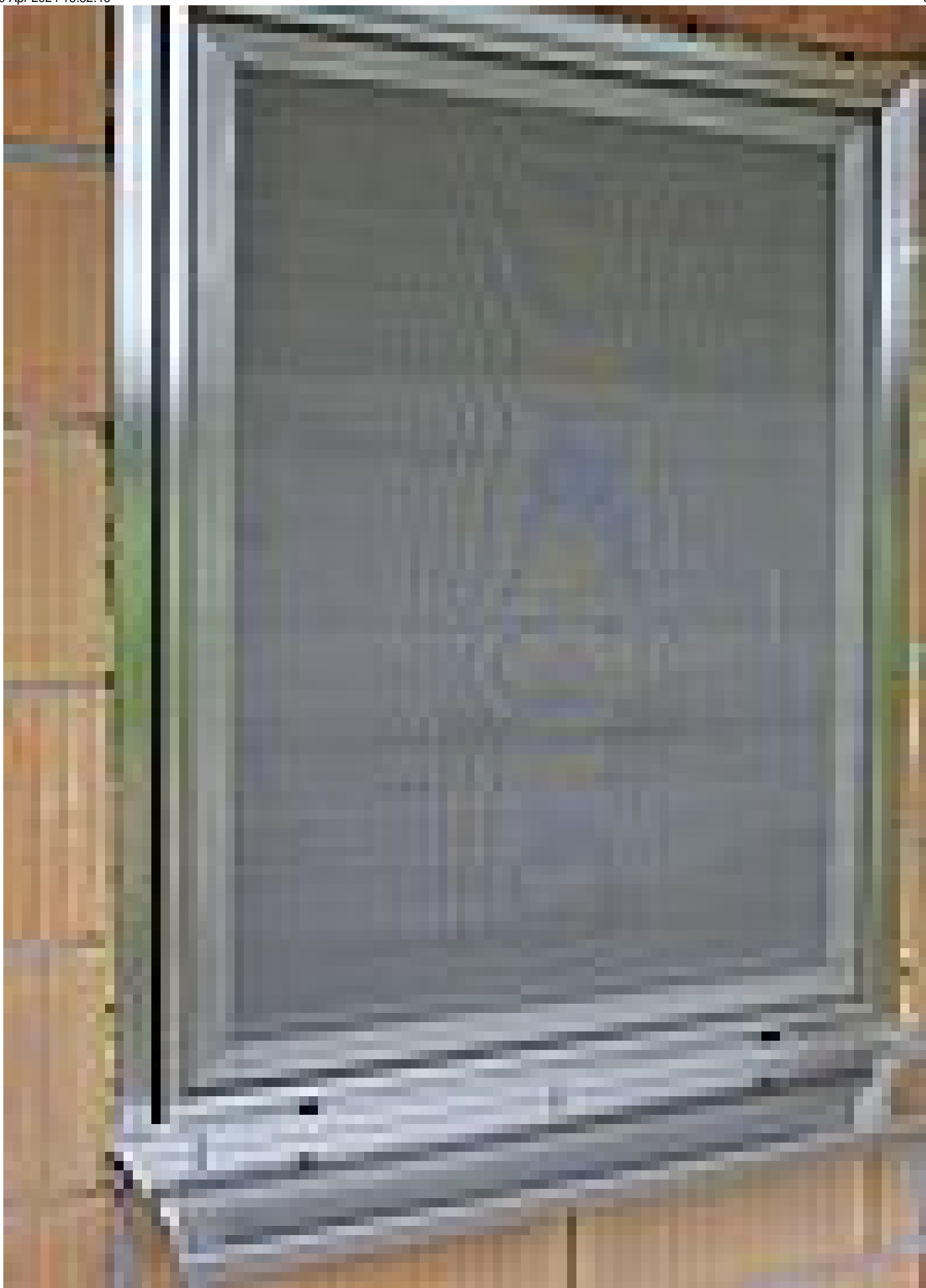
Frame window, rigid, ready for installation, made from two-sheet special 1.4301 (AISI 304) stainless steel profile with intermediate special plastic core to prevent thermal conduction, thermally insulated according to DIN 4108, U_f = 2.70 \text{ W}/(\text{m}^2 \cdot \text{K}) .