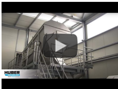
Video: HUBER Grit Treatment Systems

https://www.youtube.com/watch?v=nNstEvZA-24